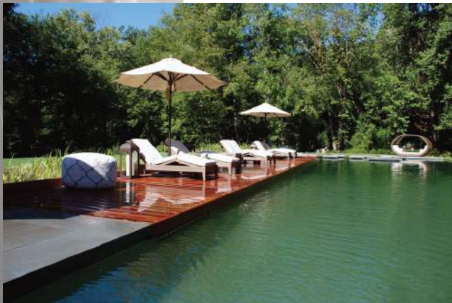
Danbury, CT - USA

Additionally, every BioNova® Natural Pool is built with a rigorous Quality Process to ensure that your NSP is designed, engineered, and built to the approved international BioNova® standards. Upon completion, your BioNova® Partner will proudly present you with a numbered Certificate of Authenticity.