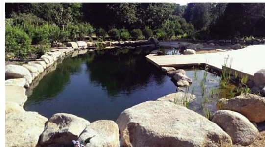
Martha's Vineyard, MA - USA