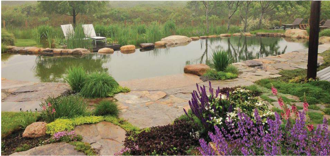
Nantucket, MA - USA