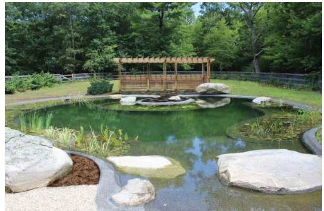
Hartford, CT - USA