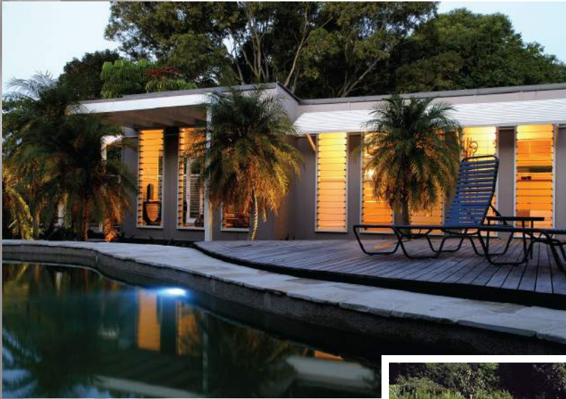
Byron Bay, Australia

Each BioNova® system is custom tailored to the landscape and to the climate where it's installed. BioNova® technology has been installed worldwide in regions with hot tropics, dry deserts, subfreezing temperatures, and more temperate climates. BioNova® systems will function effectively in every habitable climate zone in North America from California to Connecticut, and from Toronto to Texas.