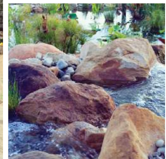
Ojai, CA - USA