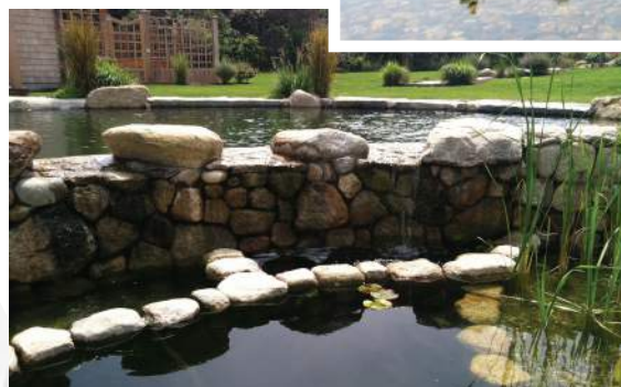
Nantucket, MA - USA