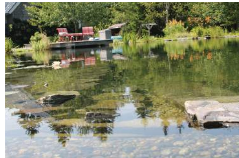
Camden, ME - USA