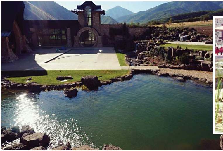
Park City, UT - USA